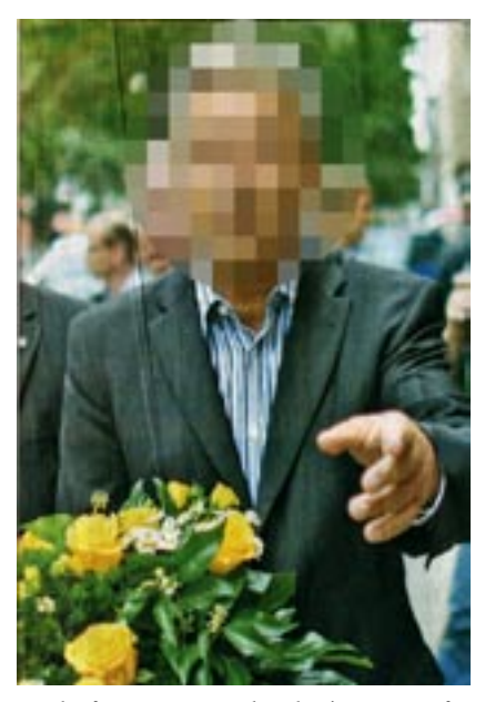
I took, for my exmaple, the innocent face of a Continental Mayor - a public figure with no need to be 'negated'.

Fooling-around with big sheets of glass and patterns of thin metal cladding is a less expensive way of preventing the eye from 'reading' the outside of a building, than scribbling all over it with deep grooves.