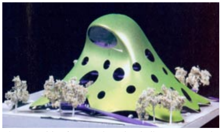
The competition for a Czech National Library was won by Future Systems. It has polarised opinion between those who hate it and vice versa.