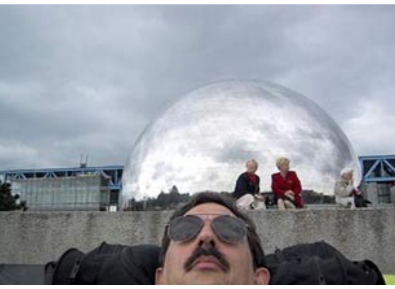
public and heroic as a building - let'Science Park' of La Villette in Paris. Designed by the Architect alone of the monumental status as these new National Libraries, Concert Halls and symbols of The spherical mirrored dome over the IMAX cinema in the Yscience Park' of La Villette in Paris. Designed by the Architect Fainsilber it disguises itself as the 'image of everything'. His 'work' becomes, at the moment an iconic 'Nothing'. Like all mirrors it cloaks itself in everything that it is not.

Edmund Burke the late 18C Radical who became a Conservative after the terror of the French revolution wrote, in his essay "On Beauty", that we seem to be attracted to objects which were both round and shiny. He put this down to the twin urges of sexuality and maternity, both of whom are triggered, visually, by the sight of bodies which are smooth and firmly rounded. While this may sound plausible. it must be among the more Hobbitishly unambitous foundations for an aesthetic of something as vast, difficult, costly, alone of the monumental status as these new National Libraries. Concert Halls and symbols of