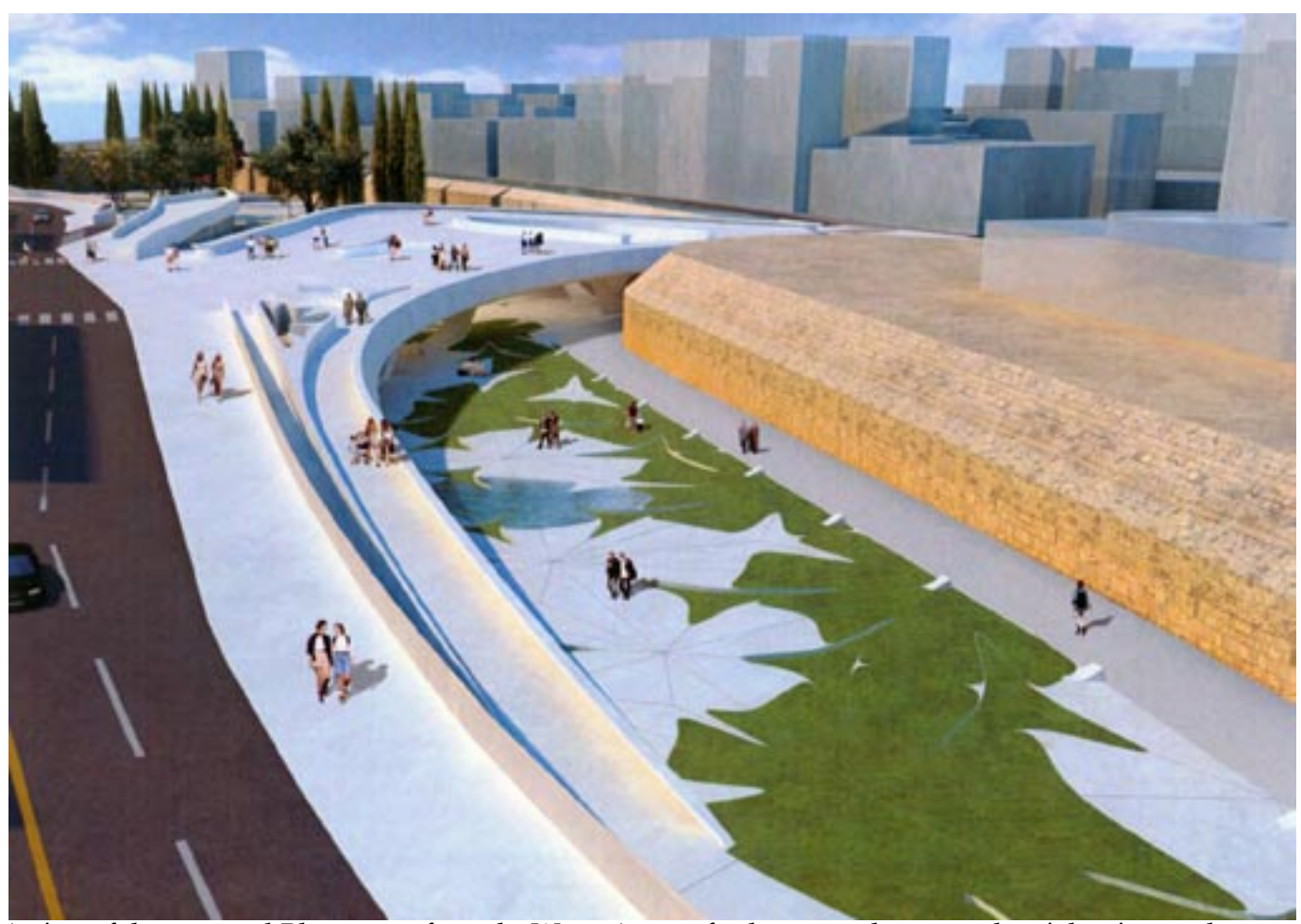
A view of the proposed Platea seen from the West. A row of palm trees, shown on the night view to the right, has been omitted. It would, in any case, throw no shade. The insistent curvatures remind one of vehicular geometries. They are not those of walkers. They will encourage skate-boarders.

either trade gossip or special pleading designed to promote the Deconstructive 'star system'. The Senate of the University of Cambridge will pay Dons to lecture young architects on History and Social Theory and Environmental Physics. But they are so disenchanted by the intellectual status of contemporary Architectural Theory that Cambridge refuses to pay anyone to teach Architectural Design, as such.