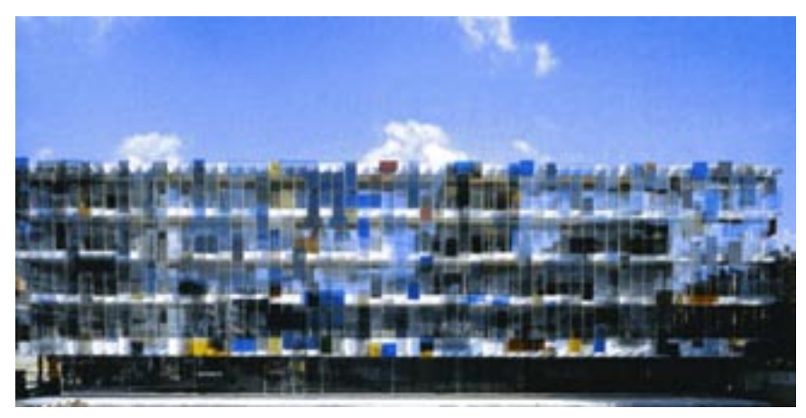
The 'Novartis' campus in Basel by Architects Diener & Diener. The street is the social space of the city. Streets are made by building-facades. A facade is the 'front' a building gives' to the street. Diener's building is the same all round . Not only is this expensive, meaning every face must be 'cheap' but it means it is a mere 'box' in space. It is urbnistically illiterate.

This makes it more widely used. The rational box can be made vaguely exciting by dithering its image in exactly the same way as a digitised image can be turned into a 'mosaic'. Except that, in the case of a building, the whole process is so gratuitously silly that it raises only a sense of despair at the mpoverished iconic culture of the many Architects who use this graphical 'spicing' of their architecturally, and especially urbanistically, illiterate compositions.