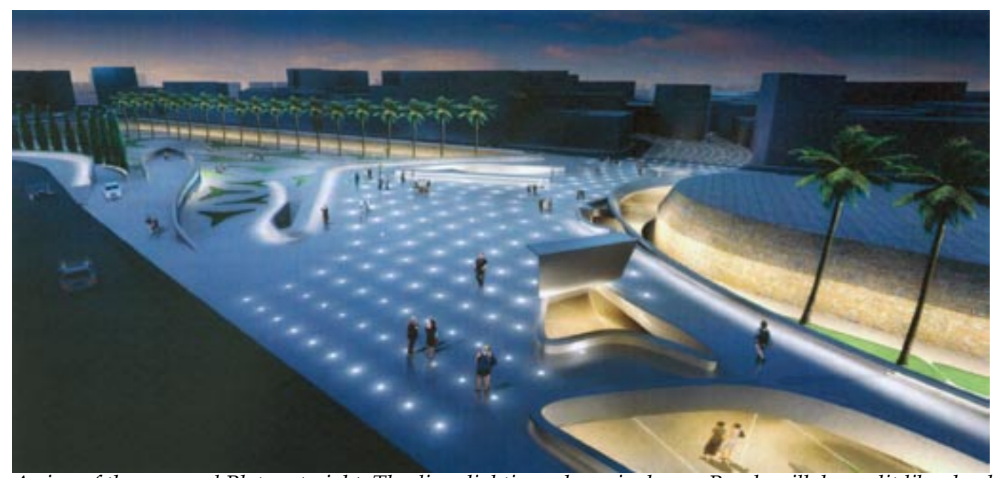
A view of the proposed Platea at night. The disco-lighting scheme is shown. People will be up-lit like ghouls. Why are their no lamp standards with flattering pools of lamp-light falling from above? How do the cafés and newspaper kiosks fit in? The Platea and the ramp down to the park will be a skate-boarder's slalom, with walkers as their obstacles.

Thirdly, its supports are not those of a bridge, they do not emphasize that the ceiling that they contact is a 'bridge-deck' that they help span from one bank to another. These unusually-formed 'supports' seem distributed at random. Their shape is not that of vertical columns. This is because vertical columns are formally taboo within Deconstructive aesthetics. Vertical columns could recall a dim and distant memory of