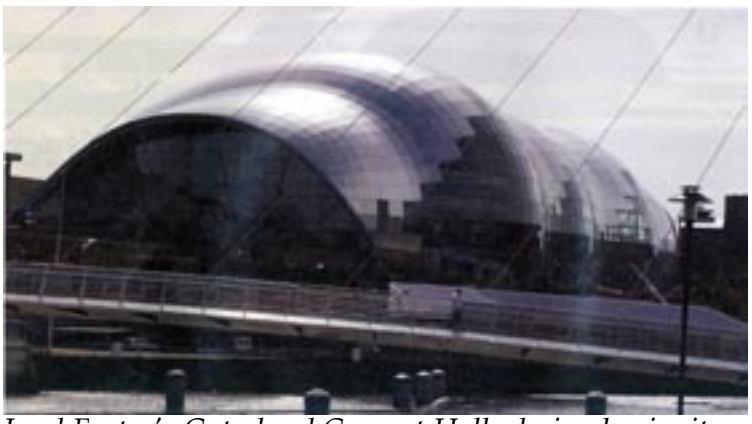
Lord Foster's Gateshead Concert Halls design buries its three halls under a glass skin whose form has encouraged the citizens of Newcastle to christen it "the Grub". But it will never hatch into anything more 'evolved'.

This makes it more widely used. The rational box can be made vaguely exciting by dithering its image in exactly the same way as a digitised image can be turned into a 'mosaic'. Except that, in the case of a building, the whole process is so gratuitously silly that it raises only a sense of despair at the mpoverished iconic culture of the many Architects who use this graphical 'spicing' of their architecturally, and especially urbanistically, illiterate compositions.