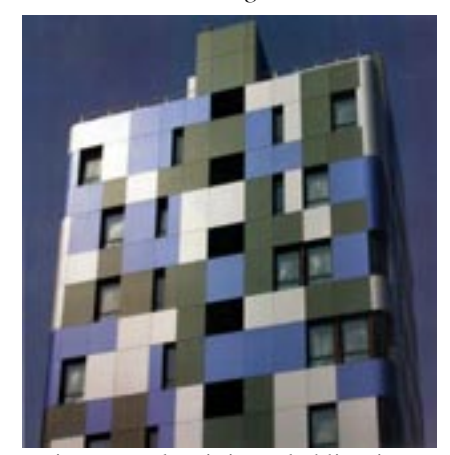
Rainscreen aluminium cladding in Oviedo, Spain is "dithered" to erase any hope of a 'cognive' act of recognition. .